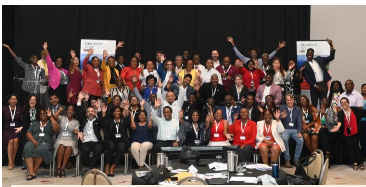
Workshop participants, Port of Spain, Trinidad and Tobago, November 2024

Participant in the 2024 IAS Educational Fund workshop in Tunisia