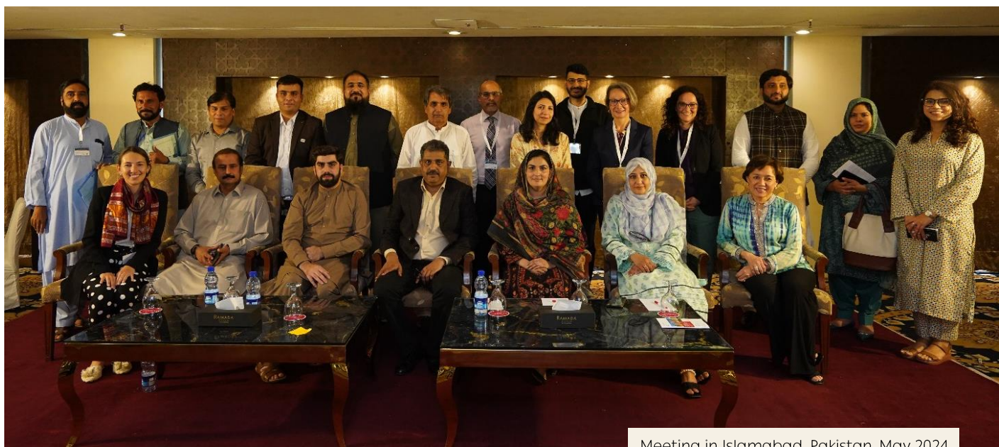
Meeting in Islamabad, Pakistan, May 2024

In Pakistan, the involvement and active participation of all stakeholders were consistently highlighted as a significant positive outcome by participants. There was widespread satisfaction that such an event was held in Pakistan, organized in partnership with local organizations Nai Zindagi Trust and Aga Khan University and focusing on carefully selected themes.