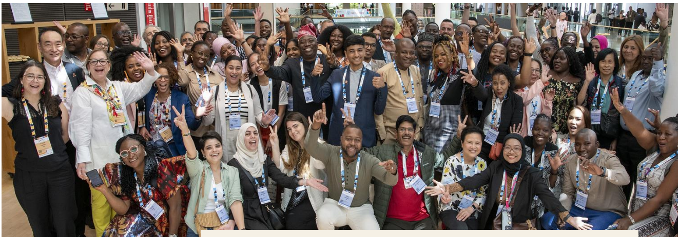
Educational Fund scholarship recipients, AIDS 2024, Munich, Germany, July 2024

For AIDS 2024, the 25th International AIDS Conference, the IAS Educational Fund provided support to 106 scholarship recipients (76 clinicians and HIV service providers and 28 advocates) from 44 countries.