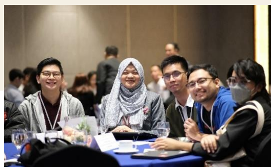
Workshop participants, Manila, the Philippines, March 2024