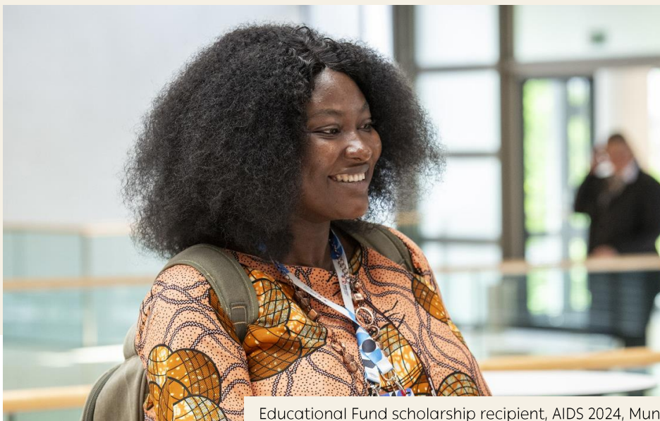
Educational Fund scholarship recipient, AIDS 2024, Munich, Germany, July 2024

Non-binary social worker South and Southeast Asia