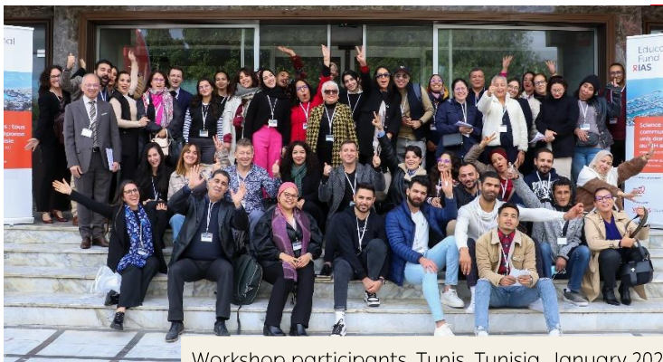
Workshop participants, Tunis, Tunisia, January 2024

Through its regional meetings and partnerships, the IAS Educational Fund encourages healthcare workers, researchers, community actors and policy makers to collaborate and catalyse action at global, regional, country and community levels on key recommendations presented and discussed during the meetings. The meetings aim to improve strategies, policies and HIV clinical practice at local and national levels. In 2024, the IAS reached 637 HIV professionals with its regional meetings.